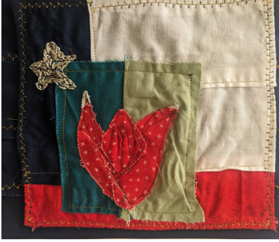
Lapageria rosea, Copihue La Estrella Solitaria, La Bandera Chilean bellflower / Chilean flag 2023