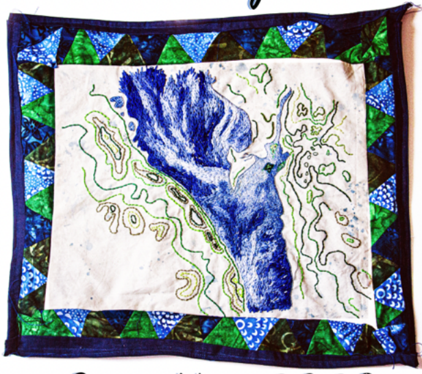
River chart: Croton, Ossining, Haverstraw, 2023 After 1950s nautical chart Embroidery thread, thread and fabric.