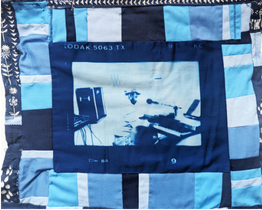
Doug, One Station Plaza, 2023 Photograph, 1993 Cyanotype on fabric, fabric and thread