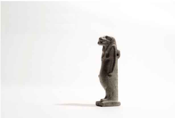
Tawaret statue, middle to late period, Ancient Egypt. From the collection of the Godwin- Ternbach Museum, Queens College.